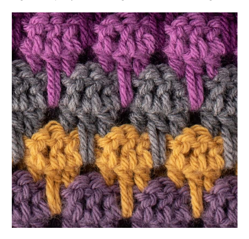
For a 50" Wide Afghan, using Worsted Weight and a H hook: Chain 172 (or a multiple of 4 for preferred width)

Work as follows: Yarn over, insert hook into indicated stitch or space, yarn over and draw up a long loop to the height of the current row of stitches (3 loops on hook), yarn over and draw through 2 loops, yarn over again and draw through last 2 loops.