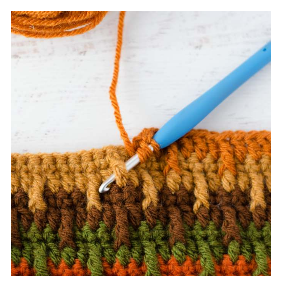
Step 1: Wrap yarn around hook 2 times (as though you were making a regular TR stitch. Then insert hook around the post of the double crochet stitch 2 rows down (see above photo).

Here are step by step photos for working the FPtr in this project: